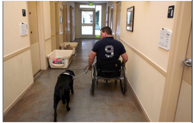
The American Legion has called for criminal investigation at the Veterans Administration. Read more at http://www.legion.org/veteranshealthcare/222522/legion-calls-criminal-investigations-va .